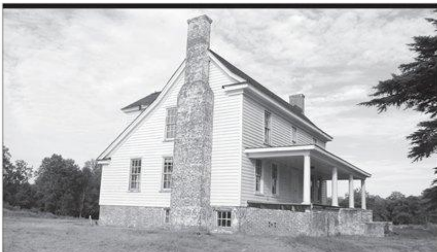
WAVERLY, off Richmond Road just past Hickory Neck Church. Built about 1852, this house is being preserved and will be renovated to serve as the community clubhouse for the Villages at White Hall.