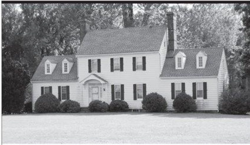
WARRENTON, 1827 Forge Road. This 19 th century house was carefully rebuilt in the 1930s using original materials whenever possible.