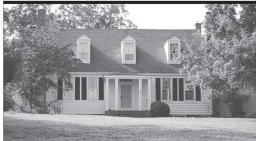
LOMBARDY, 2724 Forge Road. With portions of the house dating from the 18 th century, this working farm has been a part of the agricultural community for several centuries.