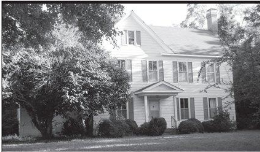
VARIETY GROVE, 2611 Forge Road. Built about a hundred years ago, this house is on the site of the earlier Marston family home.