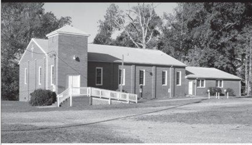
ST. JOHN BAPTIST CHURCH, 2588 Forge Road. Organized as an offshoot from Chickahominy Church for the convenience of members living in the area, the congregation is celebrating 137 years at this location in 2008.