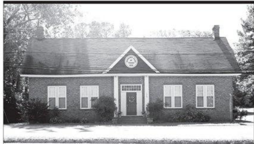
TOANO WOMEN'S CLUB, 7965 Richmond Road. Once used as the gymnasium for Toano High School, the Women's Club building now hosts many community functions today.