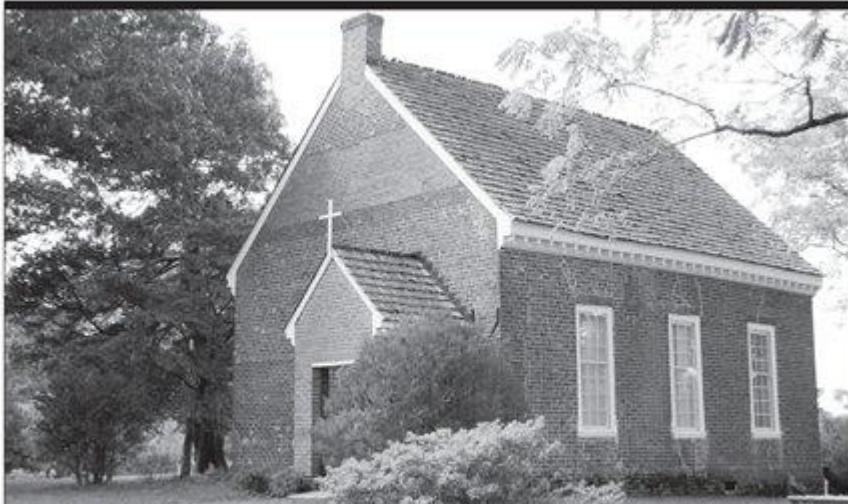
HICKORY NECK EPISCOPAL CHURCH, 8300 Richmond Road. The building seen today consists of the 1774 north transept (right two-thirds) lengthened by ten feet to the south in 1825 to create the school house that would become Hickory Neck Academy.