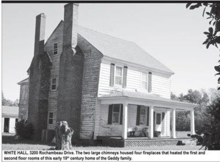
WHITE HALL, 3200 Rochambeau Drive. The two large chimneys housed four fireplaces that heated the first and second floor rooms of this early 19 th century home of the Geddy family.