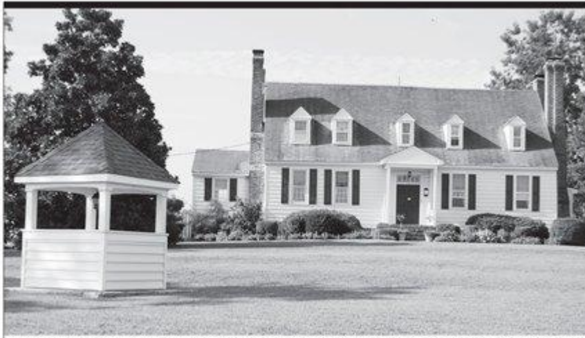
WINDSOR CASTLE, 1812 Forge Road. A typical planter's home from the mid-18 th century that was enlarged as the family grew and prosperity was on the ascendancy.