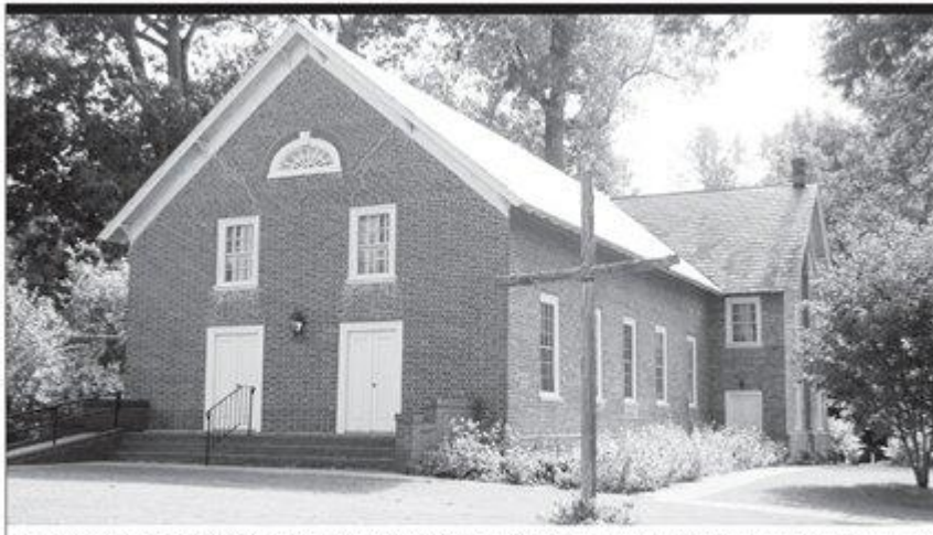
OLIVE BRANCH CHRISTIAN CHURCH, 7643 Richmond Road. Celebrating its 175 th anniversary in 2008, this congregation was organized and met at Hill Pleasant farm for several years before the present church was constructed.