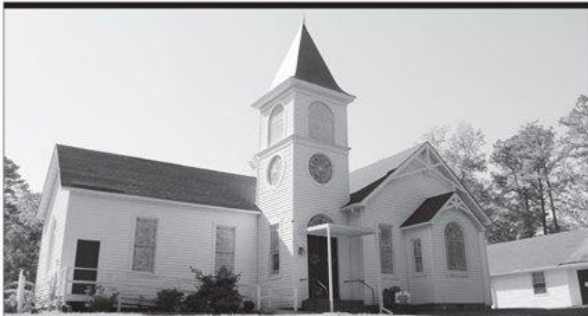
MOUNT VERNON UNITED METHODIST CHURCH, 7837 Church Lane. With its origin from as early as 1791, the church has been at this location for about 125 years.